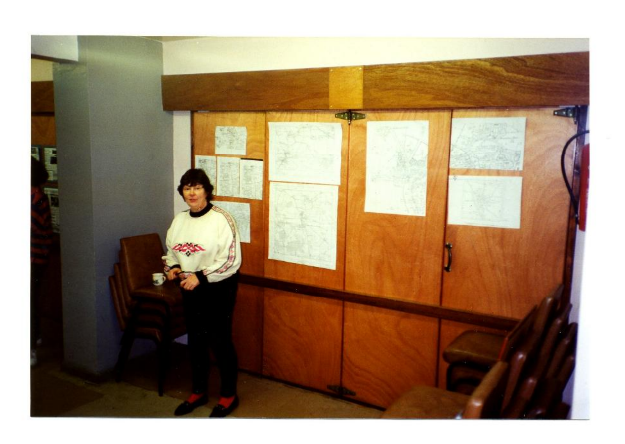
Puter Water (Trepres)

The book was launded in Argust 1994, and bold out its first printing of 600 copies by early 1995. A search printing of a feter 400 copies sold wells. By mid - late 1996 the profits anomaled to about $2000. A donatri of $500 beyord purchase rooten for straying in the Village Hall, with a fetter $2000 beld to pay for materials in the re-laying of the Chrohyard fort path.